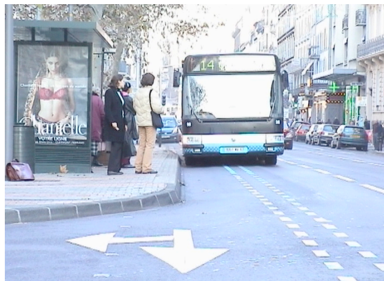
Fig. 2: The "Agora" camera-equipped articulated bus and ground guidance markings

Two metropolitan areas in France have, for the time being, elected to equip one of their bus lines with the optical guidance system (see Fig. 2). In the first (A1), which paved the way for such techniques, automated guidance has only been introduced at the level of transit stops and just a portion of the line has currently been fitted. The system operates like a vehicle-docking assistance tool, thereby guaranteeing a constant and limited deviation (gap of 5 to 7 cm) between the platform and the lower part of the vehicle body. This small deviation facilitates access for disabled passengers in wheelchairs as well as for the elderly, young children and strollers. In the second metropolitan area (A2), the guidance system has been installed at a number of stops as a docking-assistance feature and over an approximately 800-m section of line, it is used as a dedicated lane with two stops serviced, whereby the system functions like a tram.