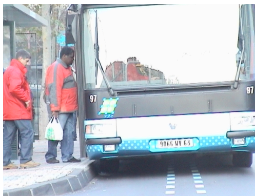
Fig. 6: Docking at greatest proximity to the platform, with guidance system deactivation: The off-center guidance line shows the best driver performance when driving in the manual mode