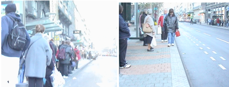
Fig. 5: Passengers waiting at platforms where pedestrians are walking on sidewalks: Obstacles requiring attention when approaching a stop

The passengers being taken into consideration by bus drivers are not just those traveling inside the vehicle, but include those waiting at the stop. From this perspective, the constraints induced by the guidance system would appear to be even greater. Passengers are in fact inclined to get closer to the edge of the platform and drivers are fearful of grazing them if they are moving too quickly towards the platform (see Fig. 5). This concern is shared by drivers on metropolitan area A1 guided routes, even though they feel that the design of the stops and guided trajectory is generally satisfactory.