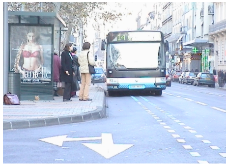
Fig. 3: Approaching a stop in a system configuration with guidance inactive: Trajectory offset with respect to the guidance marking

indicated above), or by taking excessively-tight curves or by zigzagging in instances where drivers would be able to undertake a smoother maneuver (see Fig. 3): "To avoid spinning wide on the loop, we've got to really aim well."