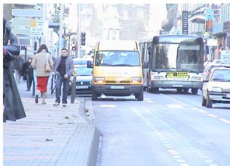
Fig. 4: Presence of an obstacle upon approaching a guided zone: Coupling with the guidance system is hindered by the obstacle to be avoided

When these conditions become overly restrictive, drivers breach the rule: "While operating with the system on when an obstacle appears, I'll disengage from the system manually, clear the obstacle and then get back into guided mode. We're not allowed to, but I believe we're all doing it."