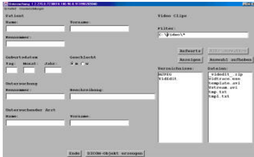
Figure 2: Front-End for DICOM conversion.