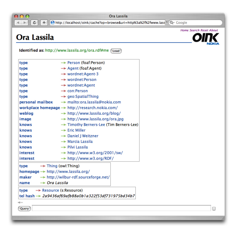
Fig. 1. A page from OINK as seen through a typical web browser

strate the utility of exposing "legacy" data in Semantic Web formalisms, often involving transformations from both file-based data as well as databases. The large body of work on mapping data between relational databases and Semantic Web formalisms is described in [17].