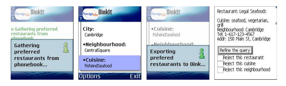
Fig. 4. Restaurant recommendation based on social collaboration

Establishing Social Connections: Once the identity of the participants is resolved using OINK, the browsing features of OINK can be used to discover social links between conference participants. By viewing the inbound links for a participant in OINK, it becomes easy to determine all the people who know the participant. This could be useful in making introductions.