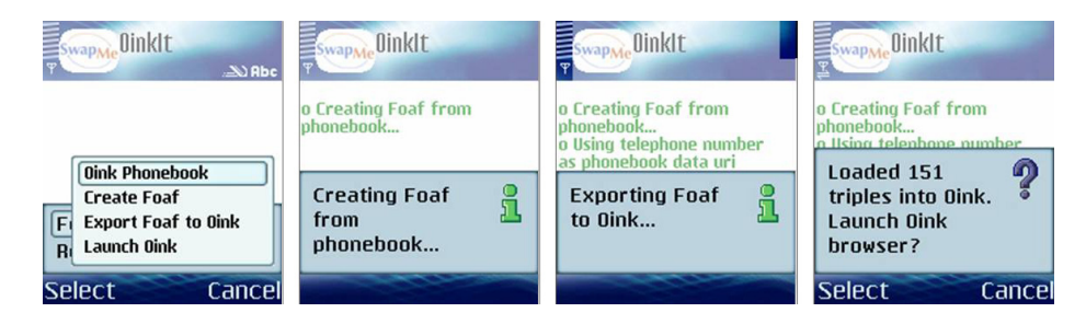
Fig. 3. Exporting a FoaF profile from the phone

Identifying Teleconference Participants: OINK's integrated view of data from Zakim and the FoaF profiles (from some of the participants) helps in identifying participants who were not previously known to Zakim. The RDF++