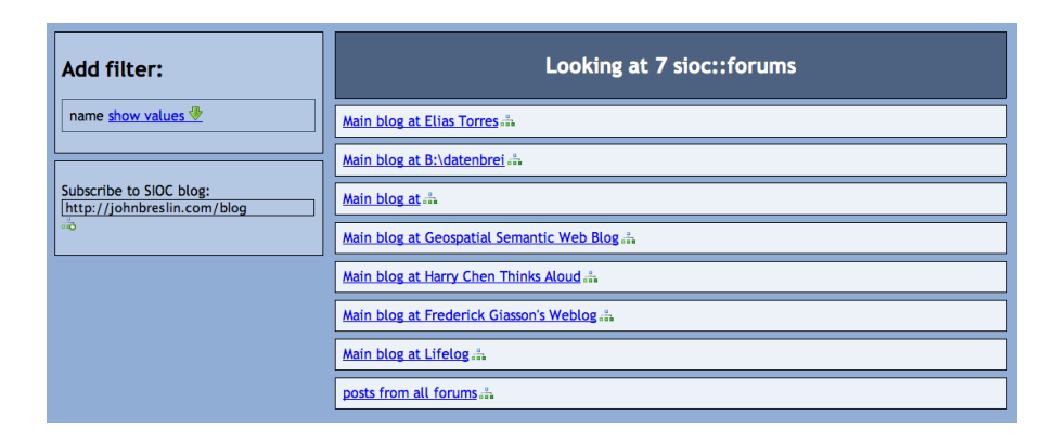
Fig. 1. Overview page of the SIOC explorer

Our prototype "SIOC explorer" aggregates data from various online community sites and allows users to browse and explore all disparate information in an integrated manner. The prototype, online at http://activerdf.org/sioc, source code at http://launchpad.net/sioc-ex, can be used as a feed reader to explore and subscribe to SIOC-enabled community sites such as weblogs, mailing lists, forums and IRC chats. The SIOC-enabled sites export SIOC data in a similar manner as RSS feeds. When prompted by the user, our application "subscribes" to such a feed and regularly polls these sites for updated content.