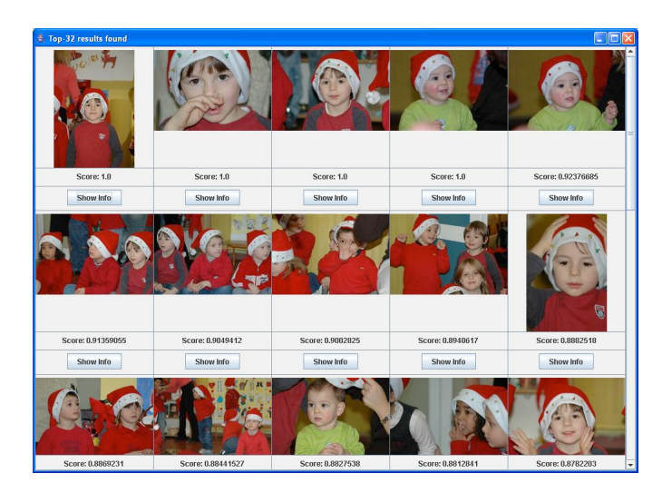
Fig. 4. DLMedia results pane.