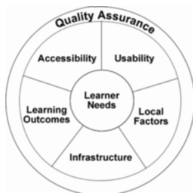
Figure 1: A holistic framework for e-learning accessibility

The ‘holistic framework for e-learning accessibility’ [3] incorporates a number of elements that impact on accessible learning. It considers the usability of resources, pedagogical aims and infrastructural and resources issues, with the aim of creating solutions that are appropriate to learners’ needs.