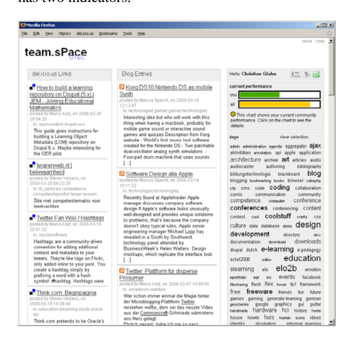
Figure 1 Screenshot of team.sPace with authenticated user

For testing the contextual conditions for the adaptation strategy we removed the initially implemented adaptation strategy and made each indicator available only to one user group. The assignment of an indicator was static, which means that the users received only one visualisation of their interaction footprints for the entire period of the experiment. Apart from the different indicators about their interaction activity all participants used the team.sPace in the same way. The modified version of team.sPace has two indicators.