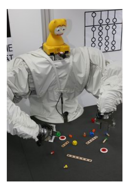
Figure 3. The JAST dialogue robot with a selection of wooden construction-toy components.

API interface to the commercial Dragon NaturallySpeaking speech recogniser [21]. A camera mounted above the common work area provides two-dimensional images of the contents of the workspace. The information from this camera is pre-processed to extract regions of interest (ROIs). The extracted ROIs are then processed in parallel by a template-based object-recognition module [20] and a module that performs static hand-gesture recognition [33].