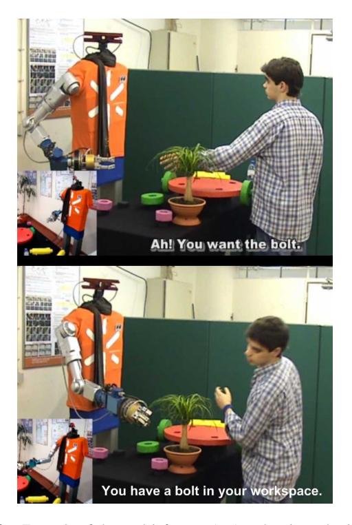
Figure 2. Example of the goal inference (top) and action selection (bottom) capacities which are implemented by the dynamic field architecture. The robot uses speech to communicate the results of its reasoning about the behaviour of the teammate.