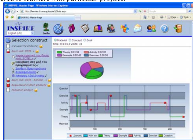
Fig.4: Mirroring learner’s interaction with the content modules of a ‘Use’ page at a fine observation grain . In this screenshot, the learner’s navigation pattern at a particular educational material page is illustrated. Note that ‘x’ illustrates long intervals.

Information at the intermediate observation grain reflects learners’ current activity with the content of a concept, their progress, as well as their preferences on specific types of resources. This information may support learners plan their work and cultivate their style awareness. Moreover, sharing this information with peers may support learners seeking for help. It may also support tutors acquire an image for the learners’ global activity, progress and needs as well as for the adequacy of the resources offered to learners with particular profiles.