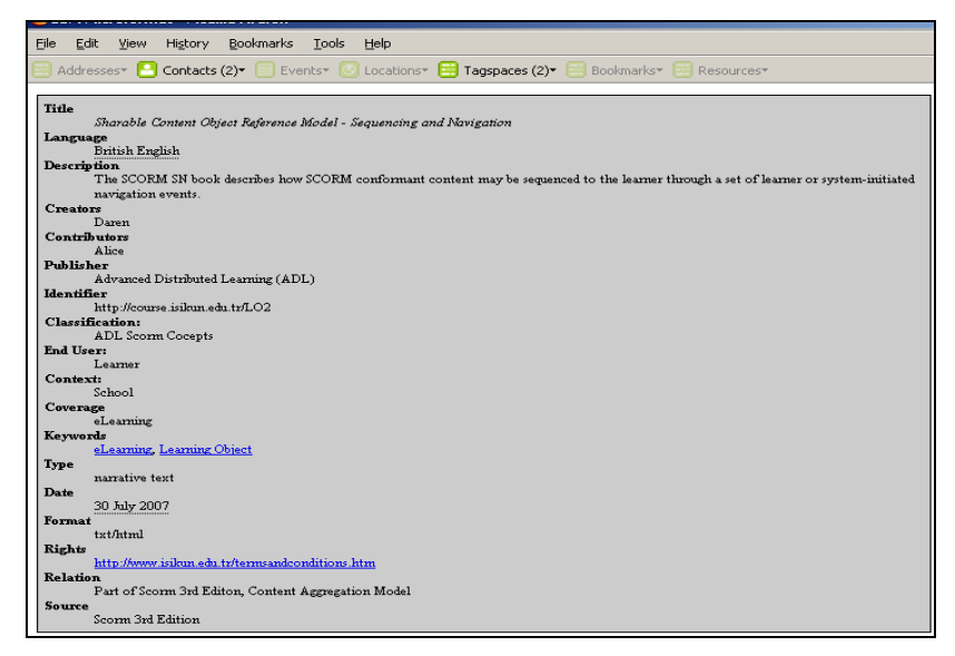
Fig. 2. Extracted meta-.data of an exemplary learning object encoded with our microformat.

The proposal of microformat was quite straight forward in this case, because the base applications profile itself is already simple and flat as there is no aggregate element used in application profile at all. Most of the elements has been directly associated with a 'class', i.e. class design pattern, attribute. The 'creator', 'contributor' and 'publisher' elements are used together with 'vcard' identifier. This is because the domains associated with these elements are based on 'vcard'. The abbrdesign pattern has been used for the 'date' and 'language' elements. The only elemental microformat, i.e. the 'rel-tag' microformat, is utilized for the 'keyword' element. Fig. 2 depicts the extraction of the proposed microformat.