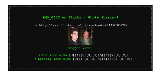
Fig. 1. Exemplary result from CaMiCatzee.

It is a trivial truth that, in order to use any kind of content or service on the Web, one must know how to access it (that is, to know the URI). What is true for the Web of Documents is equally true for the Web of Data. While with the rise of linked data [1, 2] the situation has changed—publishing and consuming data is now possible straight forward—there are still a number of issues in the discovery process. For example, with our multimedia interlinking demonstrator CaMiCatzee [3] we have identified issues around trust and believe of information regarding linked data in general and multimedia content in special. CaMiCatzee allows the FOAF-profile-based search for person depictions on flickr. However, when looking at Fig. 1, how can we find out if one of the depicted persons actually is Sir Tim Berners-Lee?