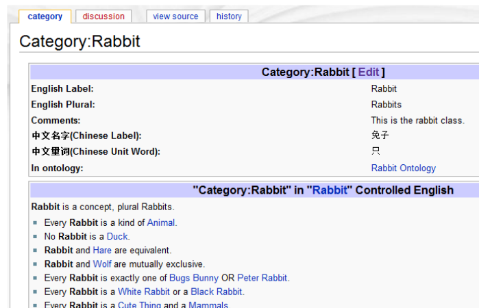
Fig. 2. Semantic wiki page containing Rabbit CNL sentences for an OWL class.

At the present time, the meta-modeling approach described above provides a significant fragment of representational support for OWL. The form-based interface, however, does impose limits on what kinds of expression a user can create within the system. The user cannot create class expressions of arbitrary complexity, for example, class expressions where the value of a quantifier restriction is itself a complex expression rather than a named class. The following class cannot therefore be created within the semantic wiki system using the form-based interface: