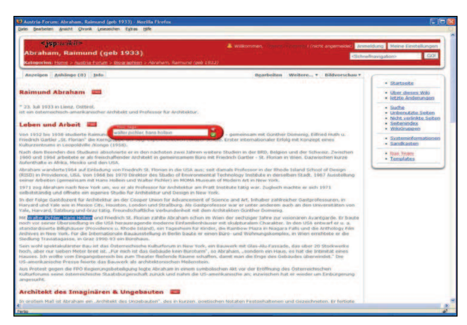
Figure 1: ST form module

The actual centerpiece of the ST module is a unit called ST plugin. It loads and manipulates the data from the ST data storage backend module, extracts user data from the ST security module and handles data sent by the ST form module via XMLHTTPRequest (see Figure 2).