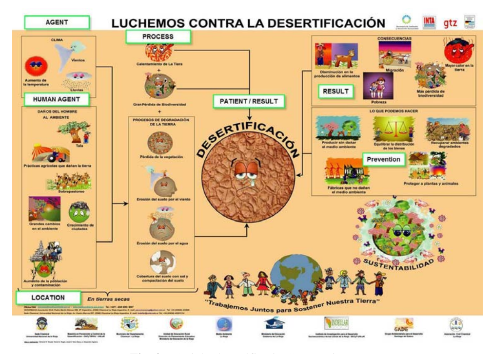
Fig. 2 – "Fight desertification" campaign

According to the EE category structure, desertification can be defined as a PROCESS [PROTOTYPICAL SEMANTIC ROLE] by which soils [PATIENT] in arid, semi-arid and dry sub-humid zones [LOCATION] are degraded as a result of human activities and