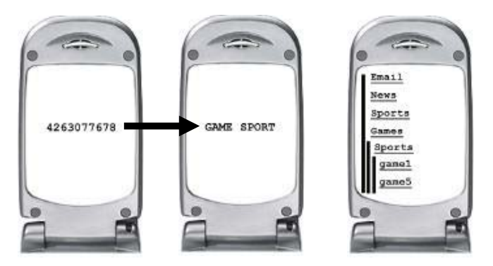
2b: Short-Cut Codes