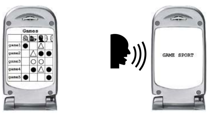
2d: Table-Based Interface