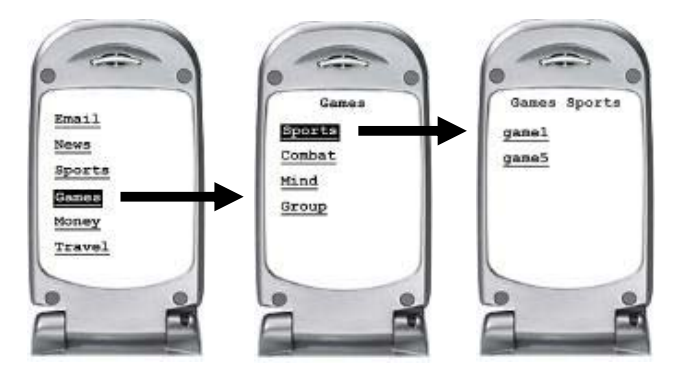
2a: Hierarchical Menu Interface

can verbally input a command to directly activate the desired function or retrieve the desired information (as shown in Figure 2e).