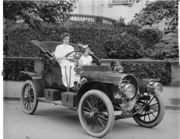
Figure 1: 1907 Franklin Model D roadster.

just to demonstrate \LaTeX 's able handling of numbering.