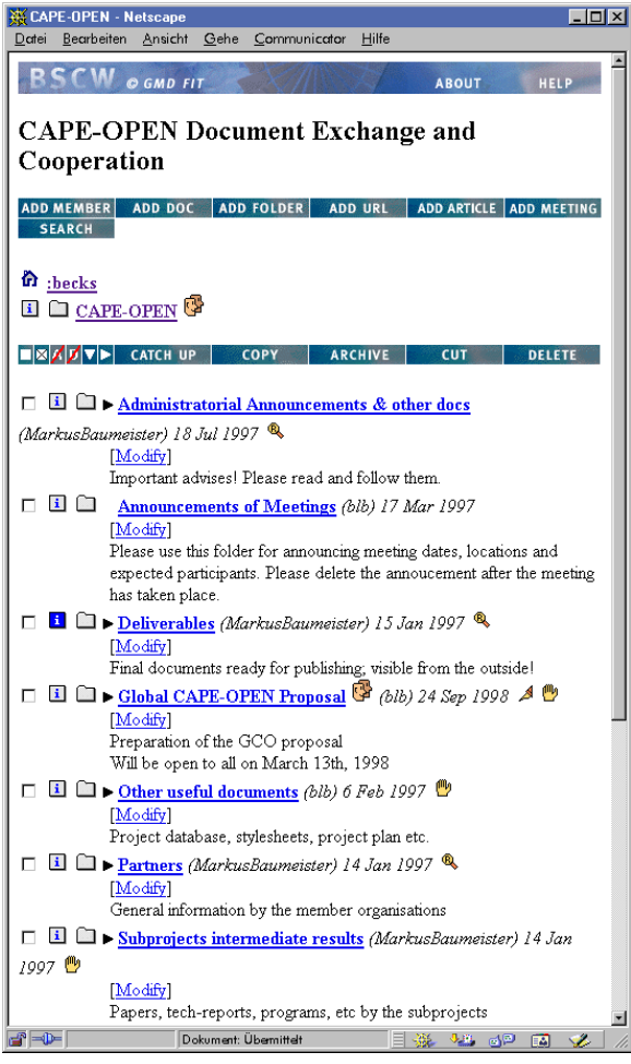
Figure 3: Screenshot of the CAPE-OPEN BSCW workspace header page

By early 1999, the workspace has almost 60 users, some of them frequent (e.g. every day), some occasional (e.g. once per quarter), others in between. Among the various facilities available in the current version of BSCW, the most useful ones still are those that were identified in the first place : the repositories for all project documents and work items, including conceptual documents, technical documents, UML models, interface specifications, reports, project management documents.. One of the two BSCWs is the back-end of a web server giving public access to a subset of the technical documents.